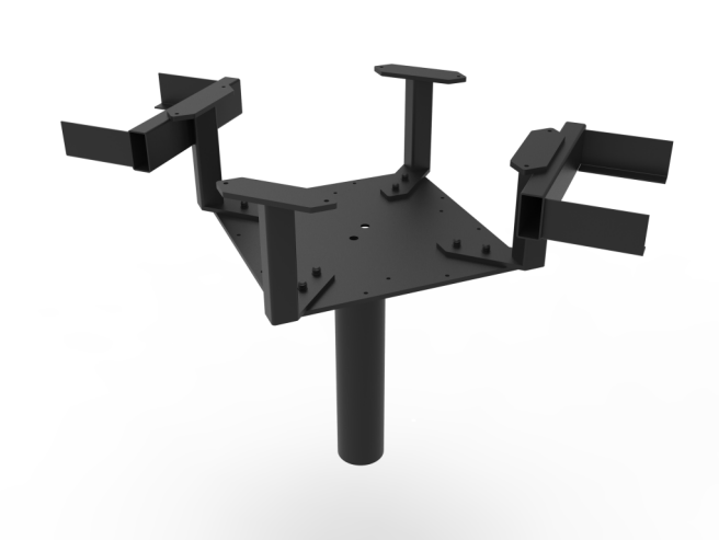
Power box kit for some configurations