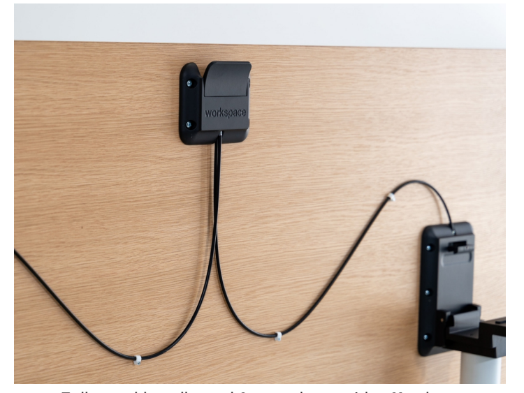
Full metal handle and frame along with effortless one-handed flip mechanism.