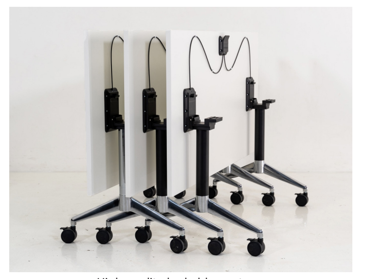
High quality lockable castors