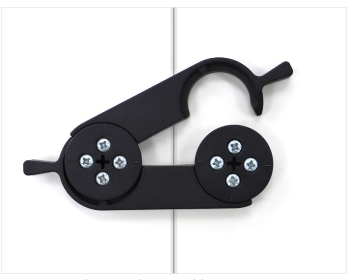
Linking mechanism table connector