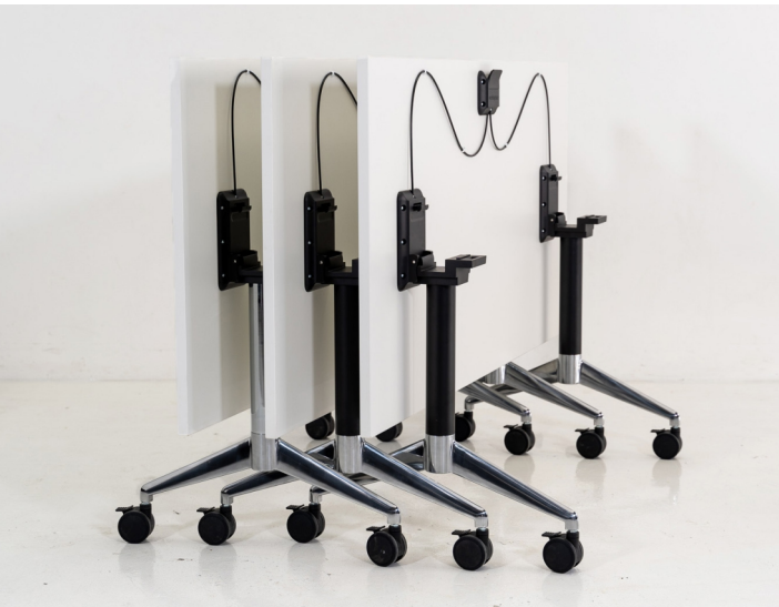
High quality lockable castors