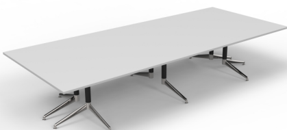
6-Post Base Fixed with Glides Height: 720mm Length: 2700 - 3600mm Width: 1300 - 1500mm