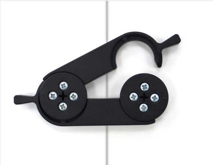
Linking mechanism table connector