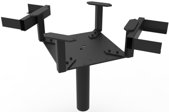
Power box kit for some configurations