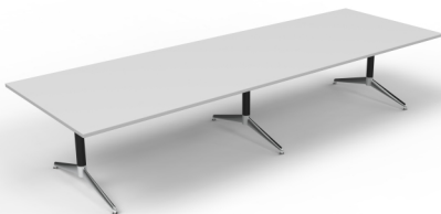
3-Post Base Fixed with Glides Height: 720mm Length: 2400 - 3600mm Width: 750 - 1200mm