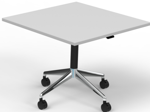
Square Flip with Castors