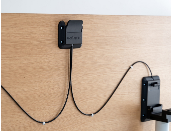
Full metal handle and frame along with effortless one-handed flip mechanism.