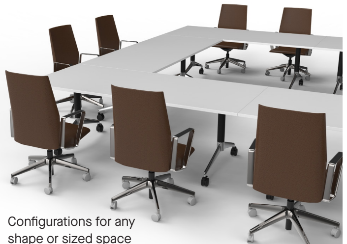
Configurations for any shape or sized space