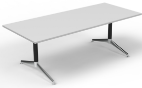
Rectangle Fixed with Glides Height: 720mm Length: 1500 - 2400mm Width: 750 - 1200mm