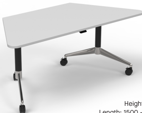
Elan Hex Flip with Castors

Height: 720mm Length: 1500 - 1800mm Width: 650 - 780mm