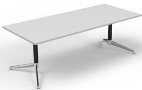
120 Degree Fixed with Glides Height: 720mm Length: 1500 - 2400mm Width: 750 - 1200mm