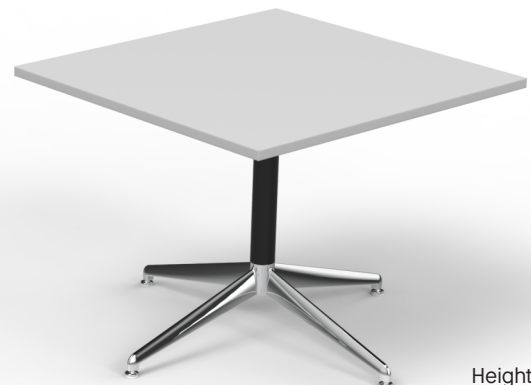
Square Fixed with Glides

Height: 720mm Length: 1500 - 1800mm Width: 650 - 780mm