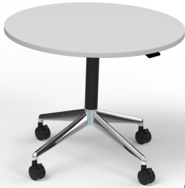
Round Flip with Castors