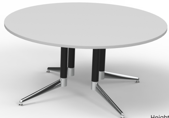
4-Post Base Round Fixed with Glides

* Length above 1810mm includes support beam