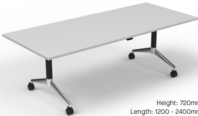
Rectangle Flip with Castors

Height: 720mm Length: 1200 - 2400mm* Width: 650 - 1000mm