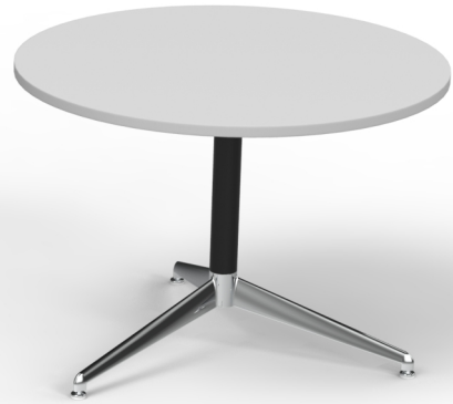
3-Star Round Fixed with Glides